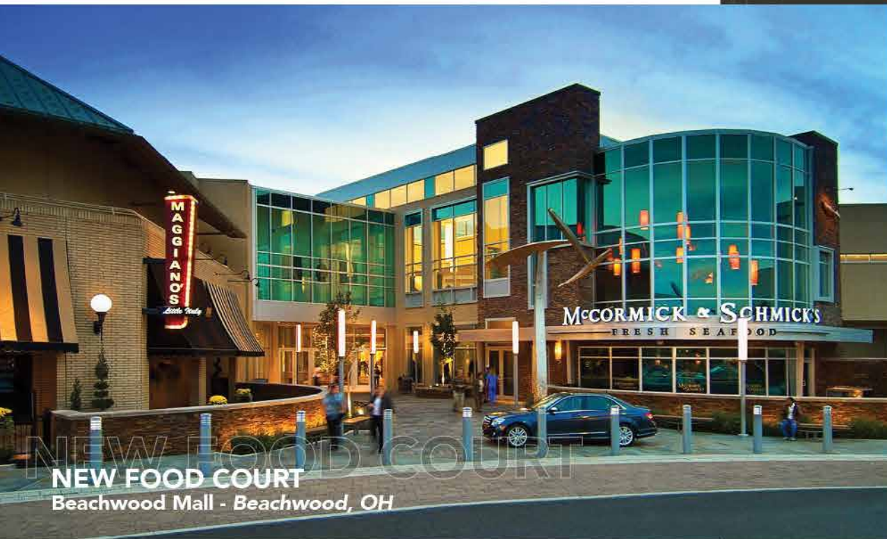
NEW FOOD COURT Beachwood Mall - Beachwood, OH