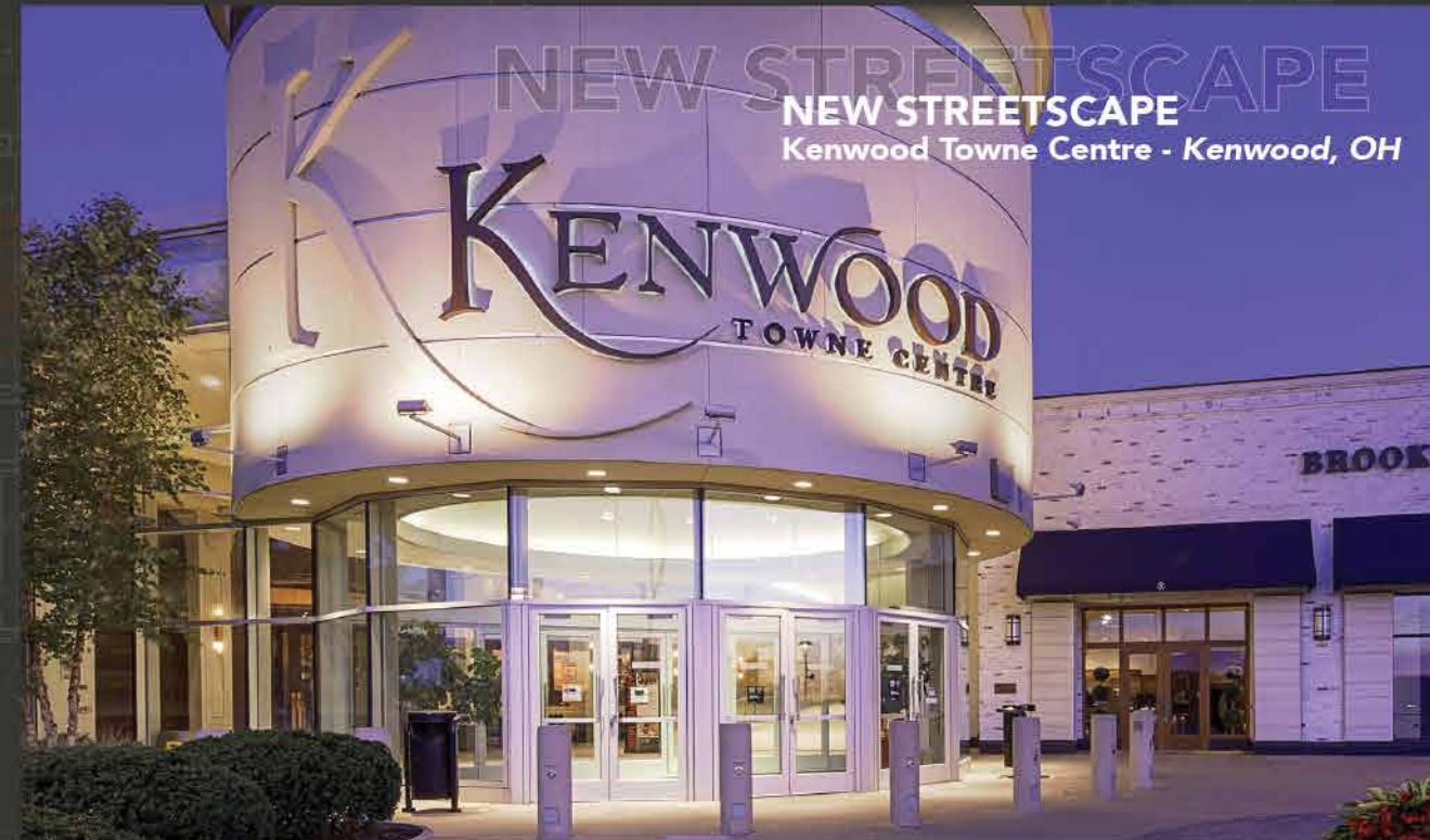
NEW STREETSCAPE Kenwood Towne Centre - Kenwood, OH